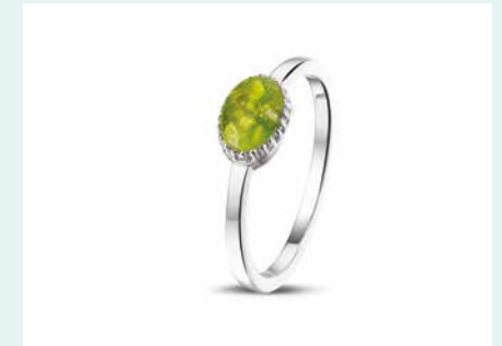
'Ashes into glass' memorial jewellery