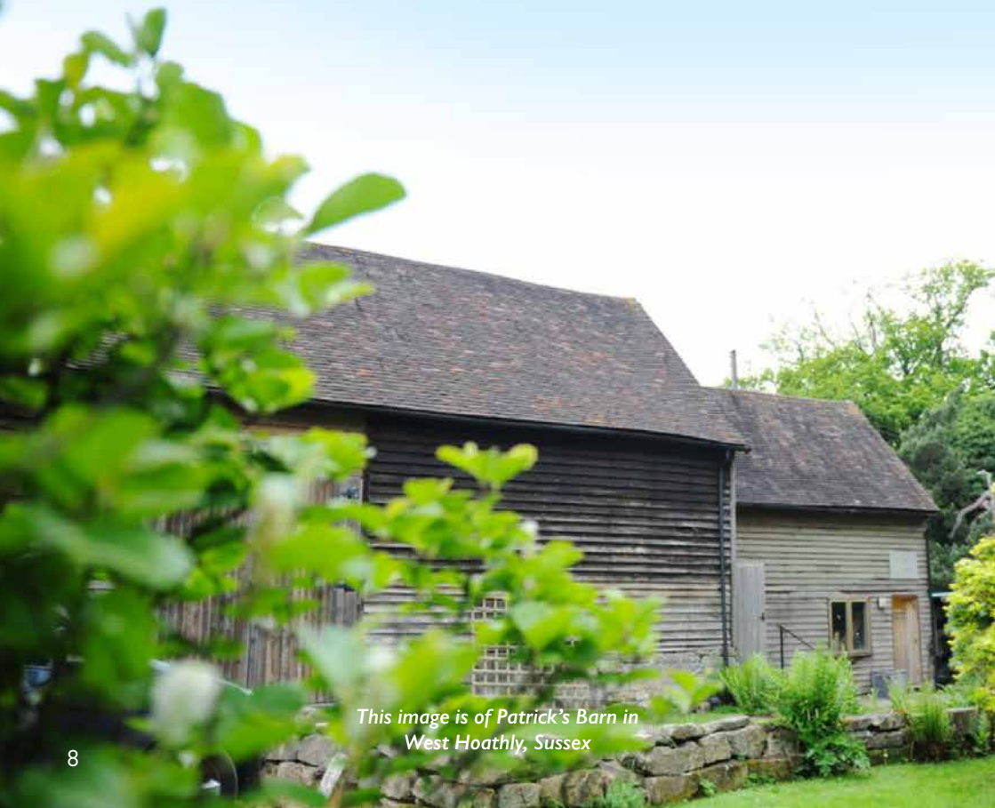
This image is of Patrick's Barn in West Hoathly, Sussex

For more information on our country funerals, please ask a member of the team.