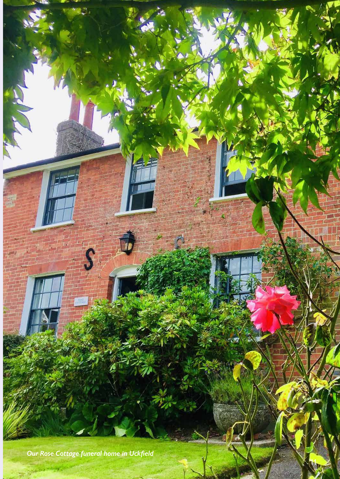
Our Rose Cottage funeral home in Uckfield