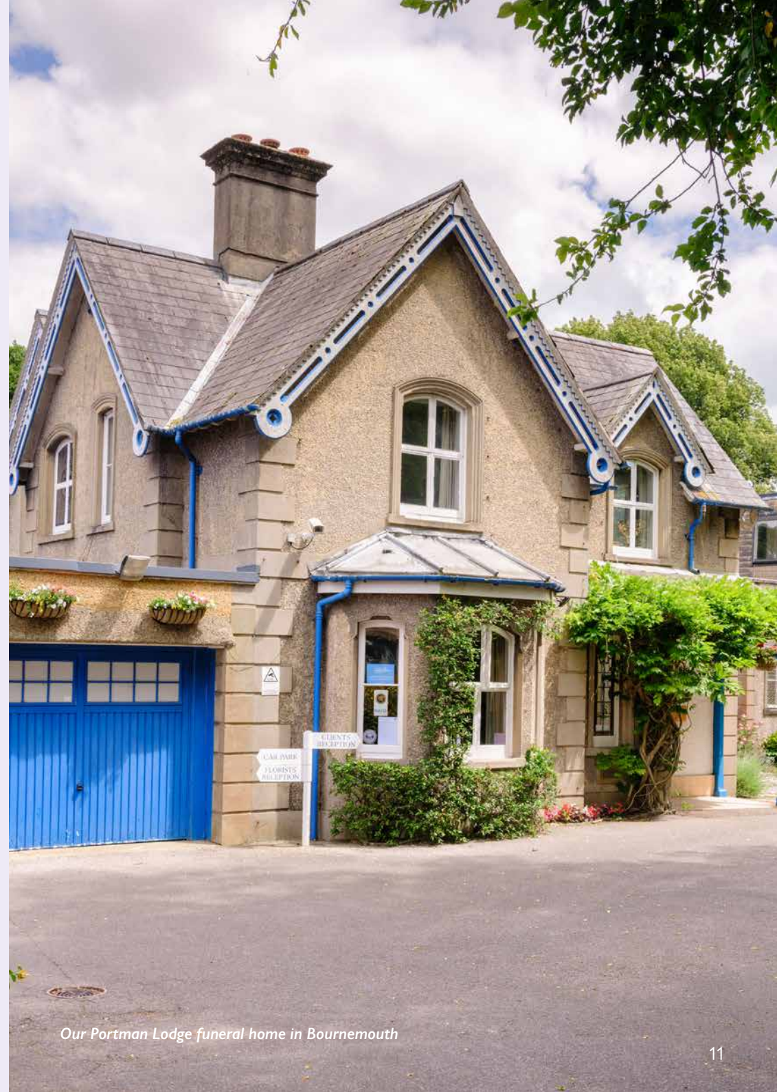
Our Portman Lodge funeral home in Bournemouth