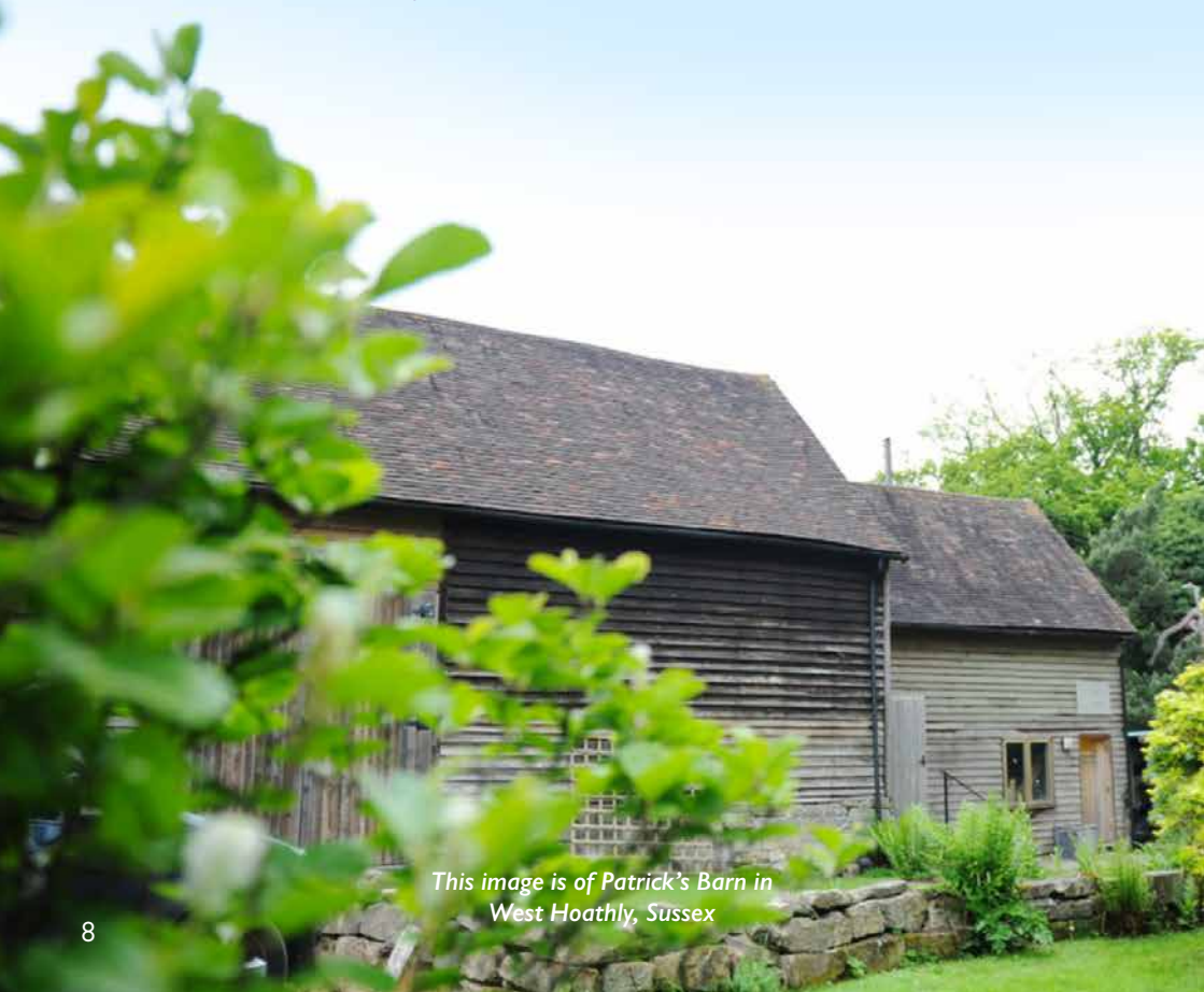
This image is of Patrick's Barn in West Hoathly, Sussex

For more information on our country funerals, please ask a member of the team.