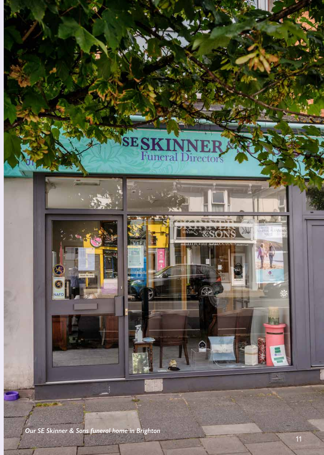
Our SE Skinner & Sons funeral home in Brighton